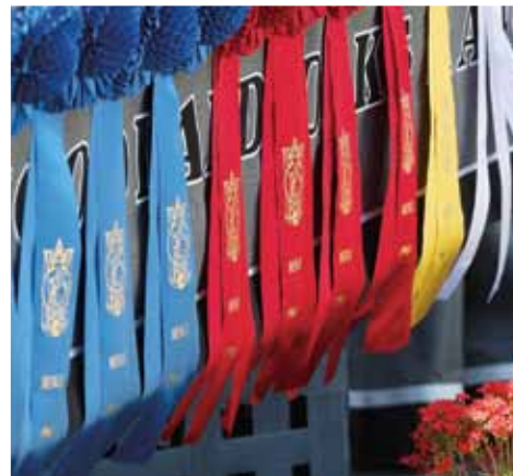
Colorful ribbons for winners of various events.

And for the social animal in your world, Menlo serves as host to lunches in the club, daily events for sponsors under the main tent – nightly beer and wine events, and the jewel in the social crown, Menlo's Friday Night Gala and Auction. This year's Gala, "Sapphire and Ice," is