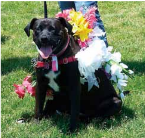
Beautiful day to dress up

The efforts of an enthusiastic group of Santa Cruz volunteers always culminated in an exciting day of pooch-oriented activities, including many for the two-legged