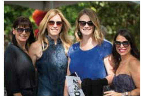
Enjoying the company of good friends for a great cause

auction and guests continued to linger under the lights in the ring of the National Center for Equine Facilitated Therapy well after the