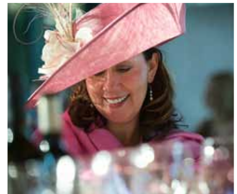
Elegance in the evening

Vintage Affaire 2015 is June 13th and will be held at a lovely Atherton location with wine tasting, fabulous food and unique auction items. Vintage Evening is June 11th for our underwriters and patron ticket holders and will be a gourmet