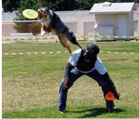
Jumping for Vista Center

attendees as well. Volunteers grilled delicious hamburgers and hot dogs for lunchtime enjoyment, orchestrated commemorative t-shirts, a popular donation drawing and robust silent auction. Sponsors and vendors added to the revenue from the day's event — for which no